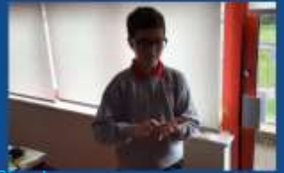
Learning British Sign Language