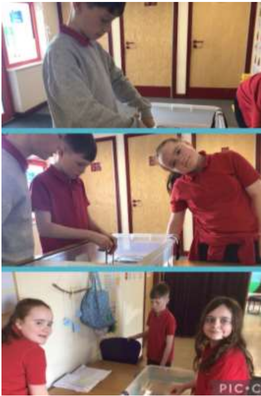
Underwater sound investigation